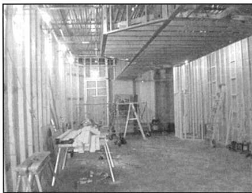
Walls were taken back to concrete and studs.

“As a retailer in downtown Winona, Minnesota for about 25 years, we felt it was a perfect time to do some remodeling inside our store. We had already put on a new storefront five years ago.