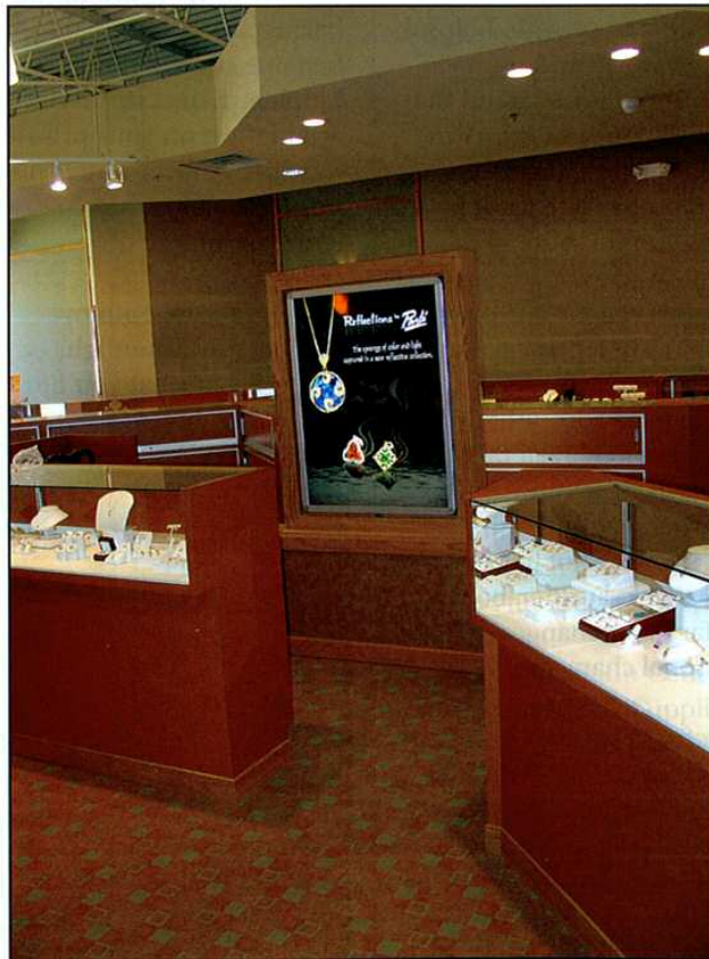
New walls, cases, signage, carpeting, paint and lighting all come together for a fabulous new look.

combination of metal halide and halogen bulbs. This was a nerve-wracking decision. Would we have too much light or not enough? Now that it's done, we