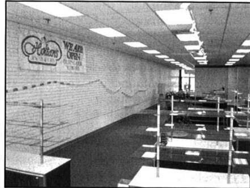
Display cases lined up in half of store prior to remodeling.

wall down the middle of the store so we can work on half at a time. As I'm writing this on Valentine's Day, we are one week ahead of schedule. Our fingers are crossed for an early completion!"