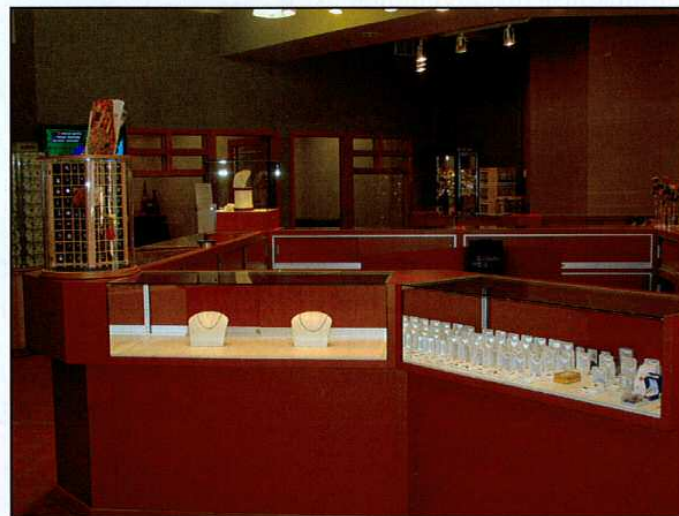
Center section of display cases. Rooms along back wall are office and diamond viewing room.