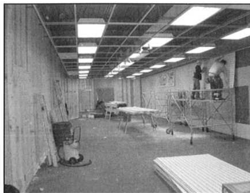
Workers preparing walls during remodeling.

Now that we had all the materials selected it was time to get bids on labor and material. This was STICKER SHOCK. It was kind of like the guy who thought one carat diamonds were $500, not $5,000. Well, maybe not quite that bad. So we got more bids before deciding