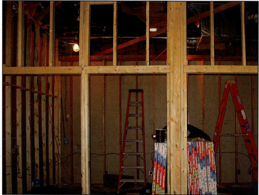
The framing is completed for two new rooms. The room on left will be an office while the room on right will be a Diamond Room.