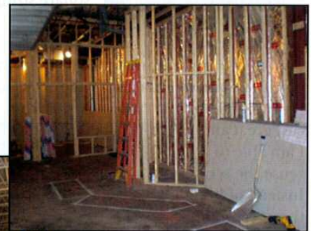
Lines on floor show future placement of display cases.