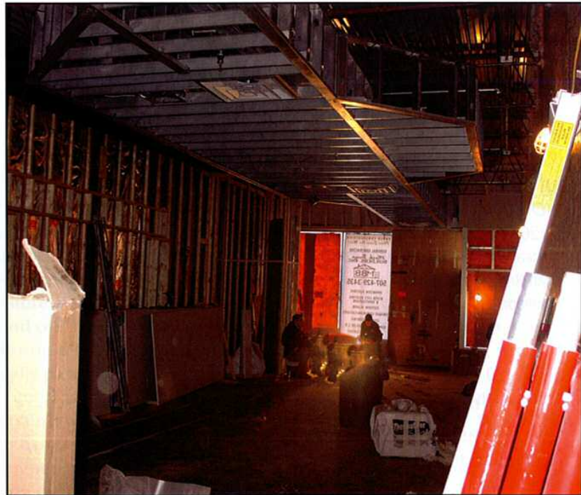
The second half of the store under construction. Display windows at front of store are papered over.

Although we work in a business of trust, I found that when taking on a major project like this, promises should be made