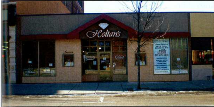
The exterior of Holtan's Jewelry & Gifts, Winona, MN was redone a couple of years ago.